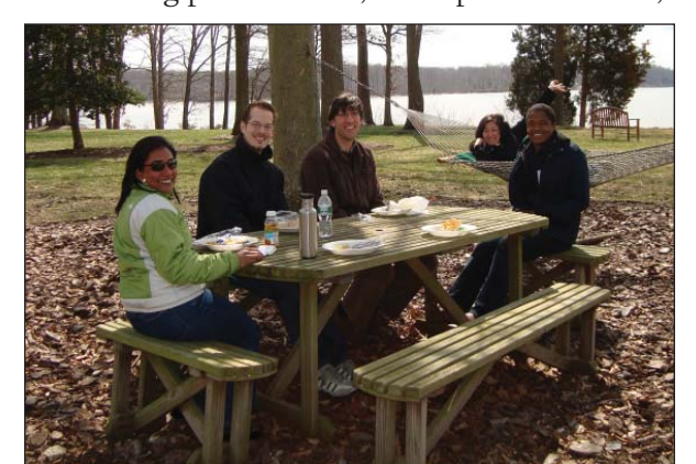
Lunch break at Point of View.

needs, small group dynamics, ripeness theory, complementarity) that underpin contemporary problem solving approaches; a training strand, aimed at developing a new generation of problem solving practitioners; and a practice strand,