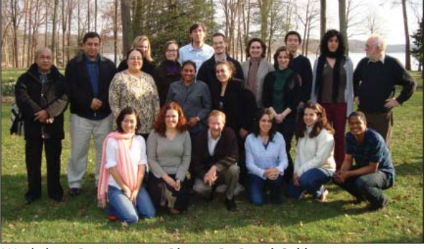
Workshop Participants.