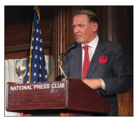
Ambassador Eliasson.

$150 billion in illegal arms trade, $150 billion in prostitution, and the trafficking of 1.2 million women and children, annually. While the public sector is taxed, none of the syndicates' money is taxed, and governments can offer little incentive to customs and border officials compared to those offered by organized crime.