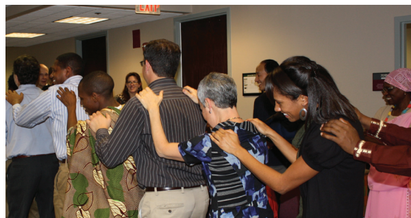
S-CAR Holiday Party Activities.

Another participant, after having a taste of the African delicacies, asked if there were any African restaurants in Arlington where she could get similar food, or even if someone present would volunteer to teach her how to make it herself.