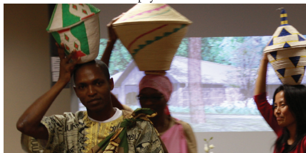
Students participating in a cultural display.

During the cultural displays, an individual noted, “This is the first time I have seen a lady carrying a basket on her head and walking and dancing with it at the same time. I was largely surprised to see that the basket was not empty but filled with bananas.”