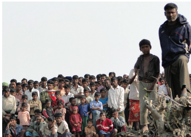
The Rohingya in Burma.