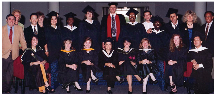
ICAR graduates and faculty, 1997.