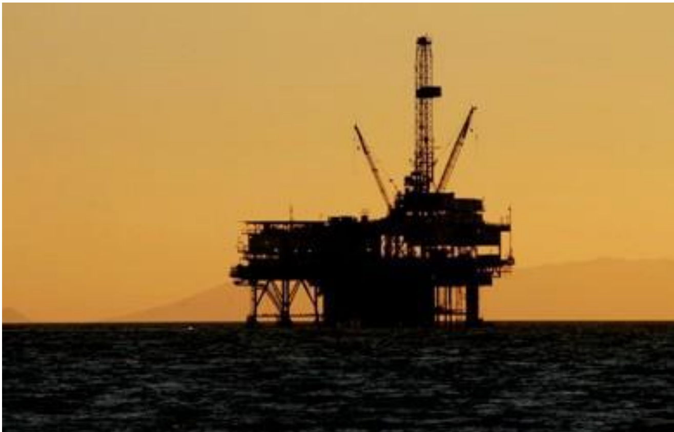
Marine Oil and Gas Drilling Platform.

Times are approximate, estimated according to typical class size and class period duration; the structure and duration of the activity can be modified to fit different schedules and class sizes.