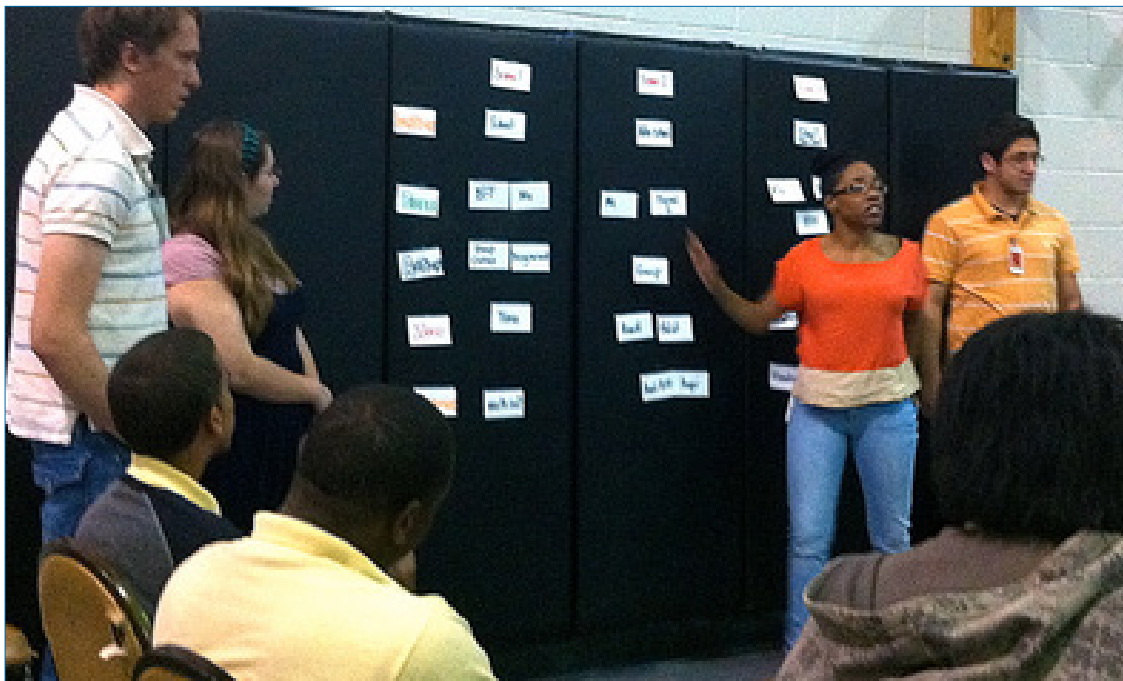
Students running an experiential learning exercise