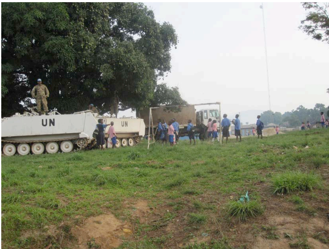
UN Troops in the schoolyard.