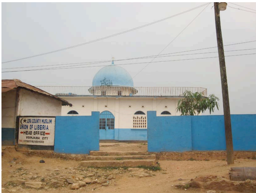
Mosque in Voinjama.