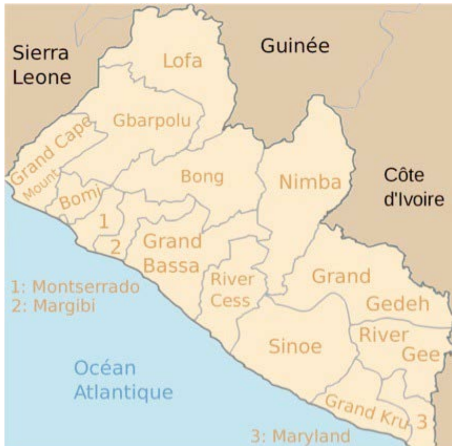
Map of Liberia