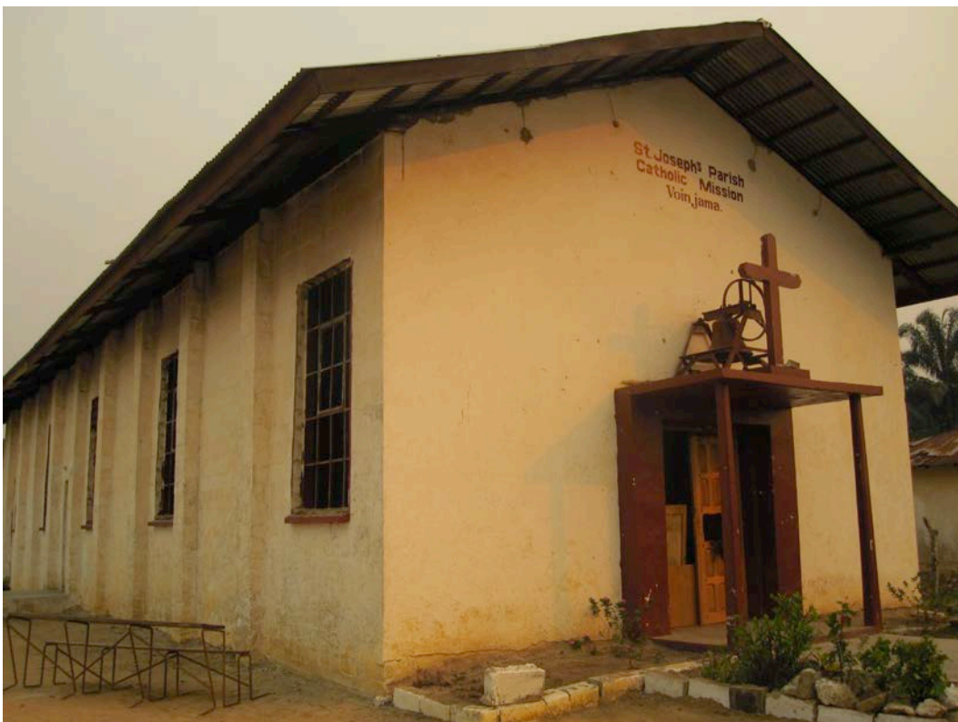
Catholic Church in Voinjama.