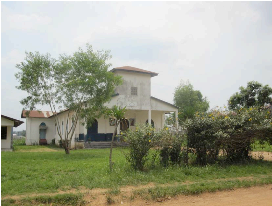
Christian church.