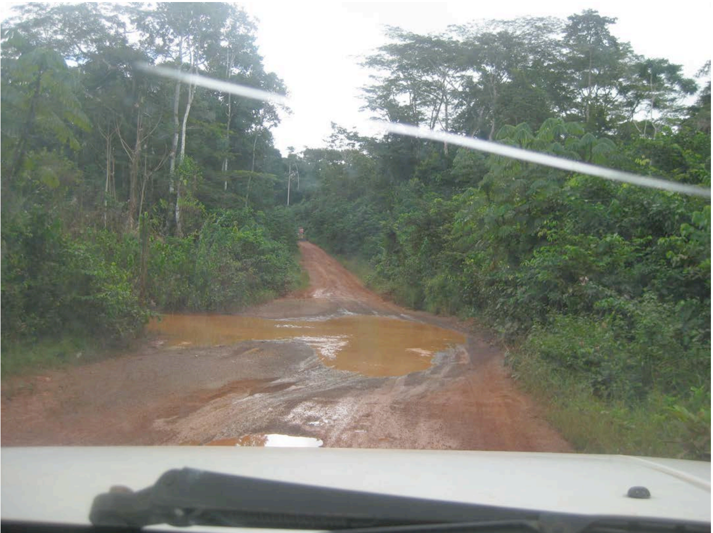
After the rain on a Lofa County road.