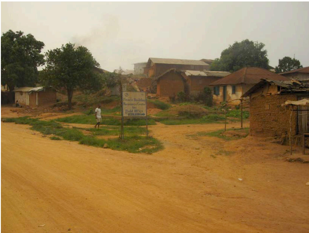
Peacebuilding Resource Center in Liberia.