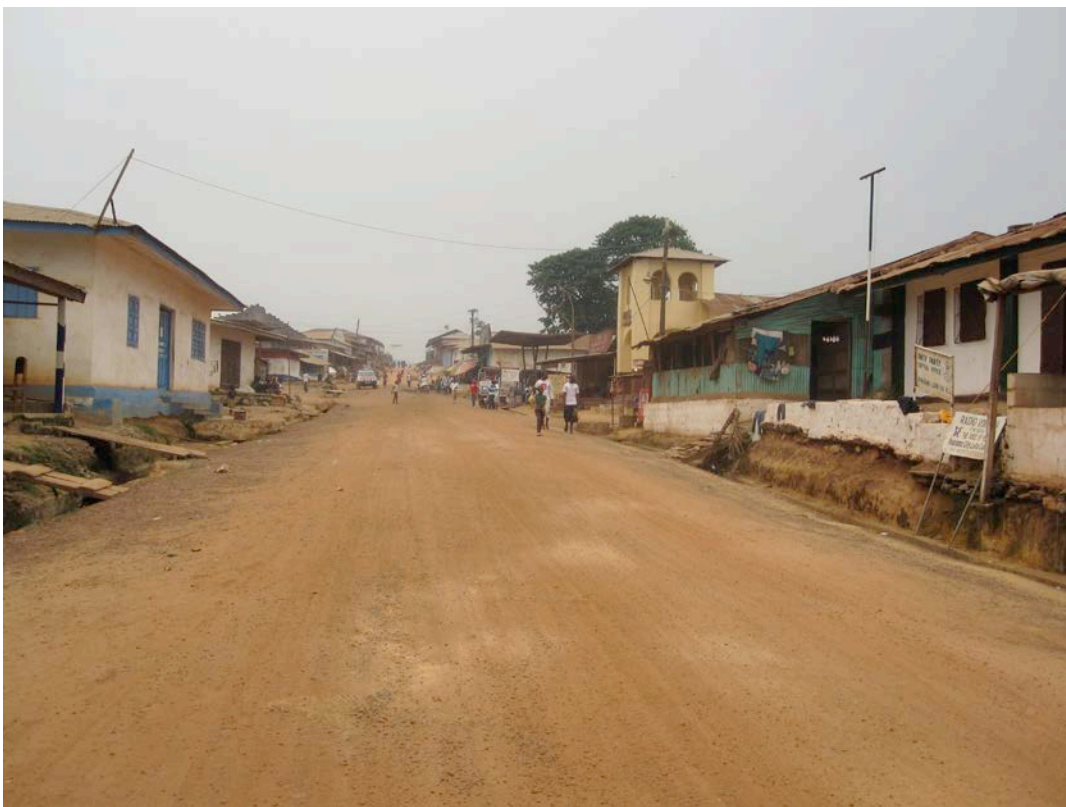
Main street in Voinjama.