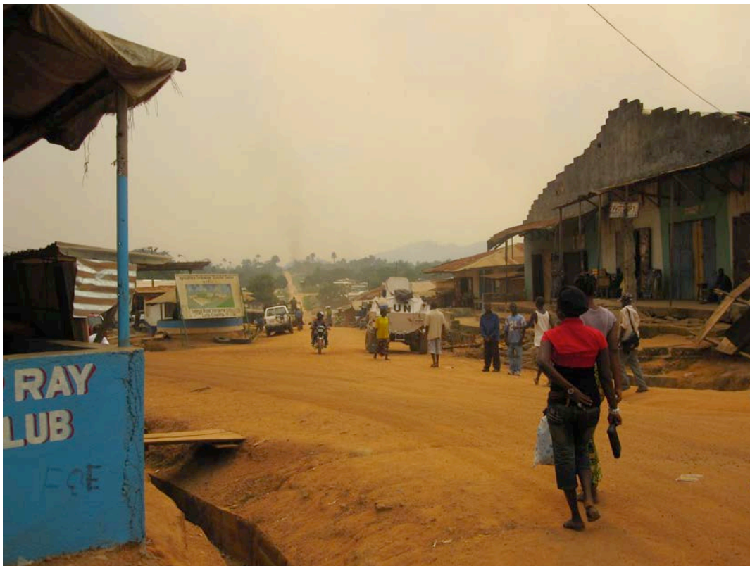
Central intersection in Voinjama.