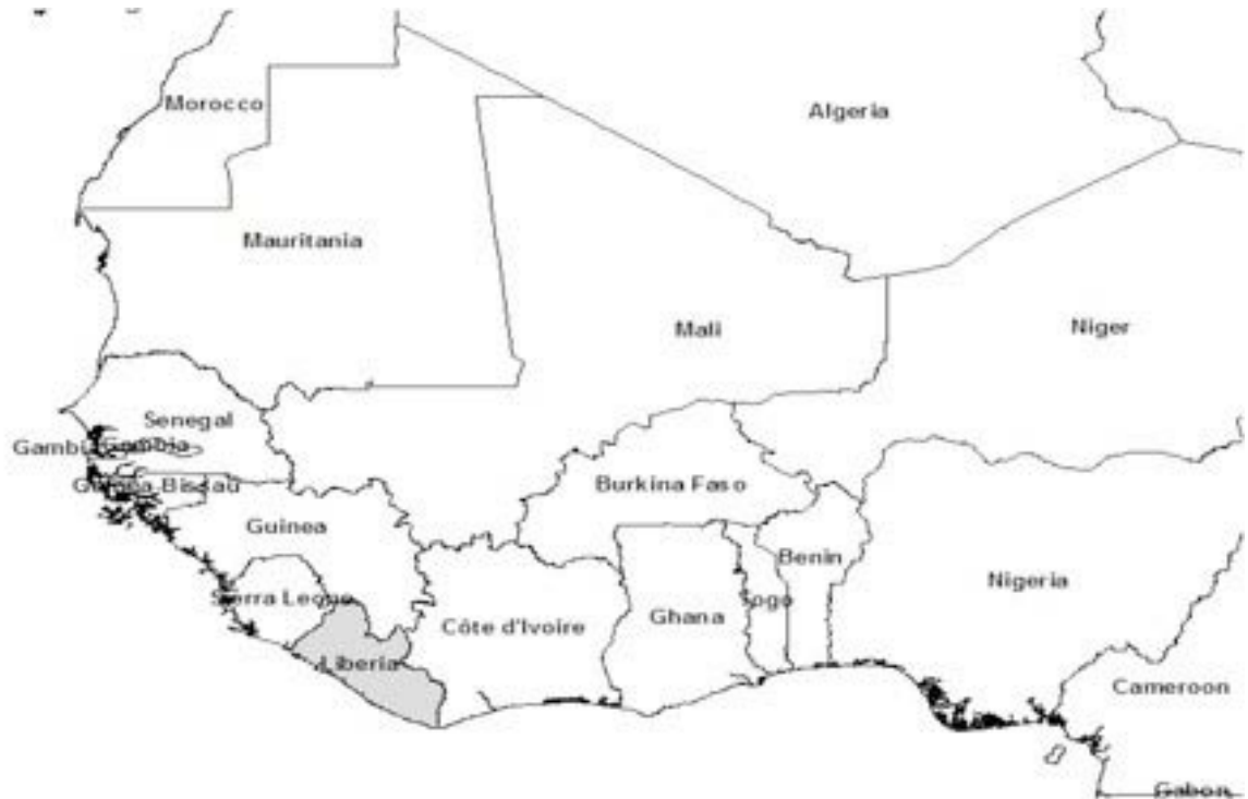
Map of West Africa