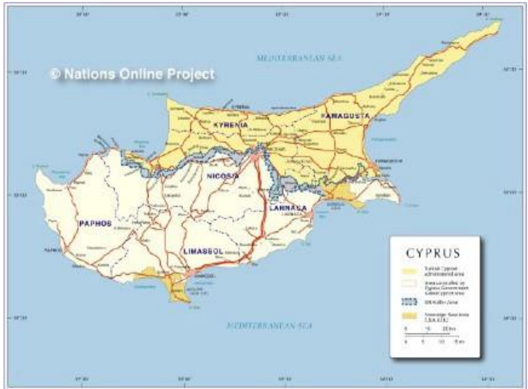
Map of Cyprus. Photo Credit: Nations Online Project.

All students should search their own party's English-language news sites for articles related to the conflicts and resource issues most important to their party. This can be done through keyword searches ("natural gas," "offshore drilling," "Law of the Sea," "Cyprus conflict," "Leviathan," "Aphrodite," "EEZ," etc.).