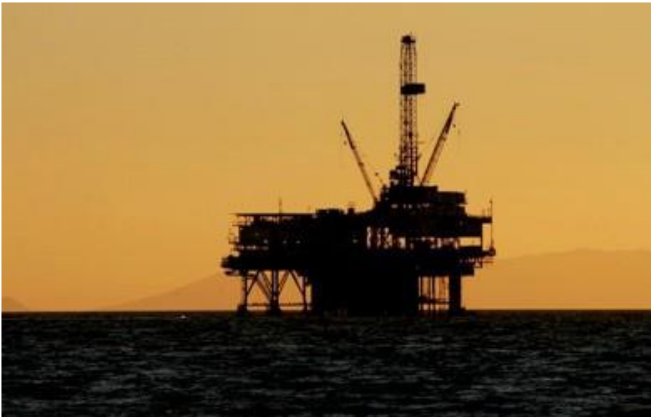
Marine Oil and Gas Drilling Platform.

Times are approximate, estimated according to typical class size and class period duration; the structure and duration of the activity can be modified to fit different schedules and class sizes.